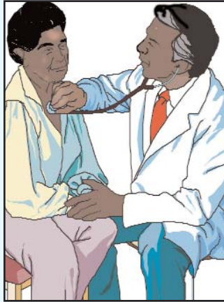
REVIEWS ARE IMPORTANT

CASE No.1: This 41-year-old man was started on ARVs twelve months ago. At that time he was WHO stage 3 with an episode of esophageal candidiasis and a CD4 count of 95. He was prescribed stavudine 40mg.bid, lamivudine 150mg.bid and efavirenz 600 mg. each night along with cotrimoxazole. He responded well to this regimen, gained weight, had no side effects except some vivid nightmares, and returned to work. For six months he attended